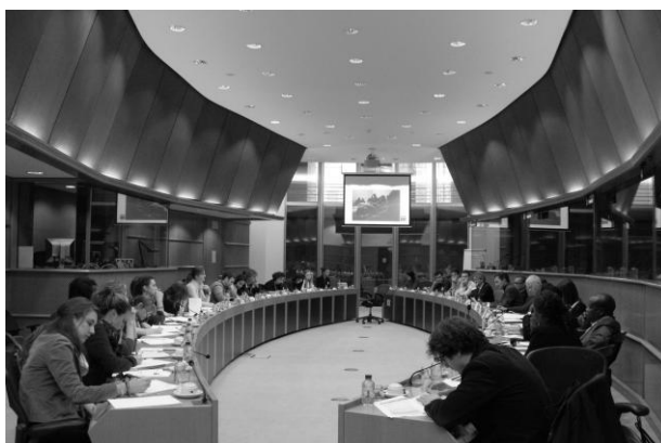
Policy Forum on Children and Armed Conflict in the European Parliament