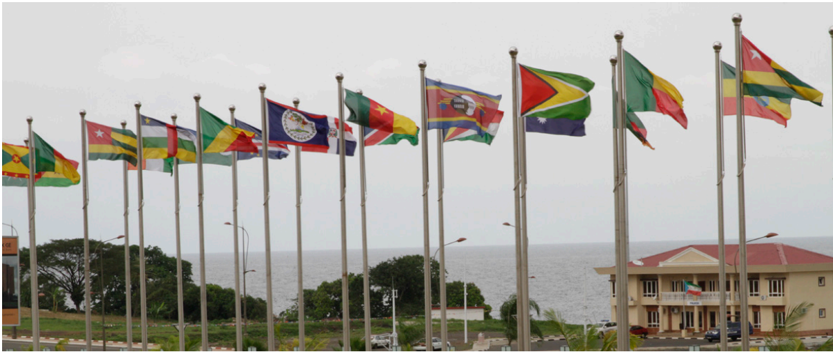
7 th ACP Summit for Heads of State, Malabo, Equatorial Guinea, 2012. Photo of ACP Group.

In 2012, EEPA undertook a study to assist the ACP Group to prepare for the expiry of the Cotonou Agreement in 2020 and its future in the post-2020 era. The study supported the work of the Working Group on the Future Perspectives of the ACP Group by examining options and delineating scenarios on the basis of a comprehensive review of the essence and value of the ACP Group. The assessment on the future of the ACP group is examined from three dimensions: the internal evolution of the ACP group; the external changes that impact on the group; and future scenarios for harmonizing these internal and external challenges.