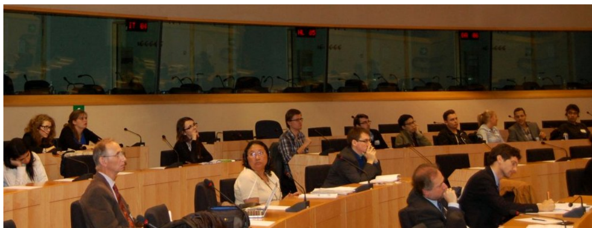
European Parliament Hearing on Renewable Energy, 4 November 2014

Following the success achieved with the first phase, the actions in 2014 sought to engage in dialogue with the European Commission on its planning for the use of the EU's financial resources for energy programmes in developing countries, and particularly for giving priority to schemes to benefit remote rural communities that have no access to mainline grid energy structures (long). A focus for this action was the organisation of an informal hearing in the European Parliament that brought together MEPs, the European Commission, NGOs and Philips. On 4 November 2014, in the European Parliament the special Hivos Energy Hearing was organized.