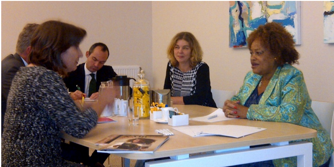
Dutch Minister for Foreign Trade and Development, Lilliane Plouman and Liberian Minister for Gender and Development, Julia Duncan-Cassell, discussing the fight against Ebola, 2014

In 2014, EEPA led the preparations and organisation of the 2 nd International Colloquium on Women's Leadership in Peace Building. The first such Colloquium was held in 2009, hosted in Liberia by President Johnson Sirleaf together with Finnish President Sauli Niinistö. This second Colloquium was prepared with the support of Cordaid, and brought together key international actors with a view of linking actions taking place to strengthen Women's leadership to address conflict and build peace in local communities, with the roles that women can play in promoting policies and practices at national, regional and international levels to support Women's leadership.