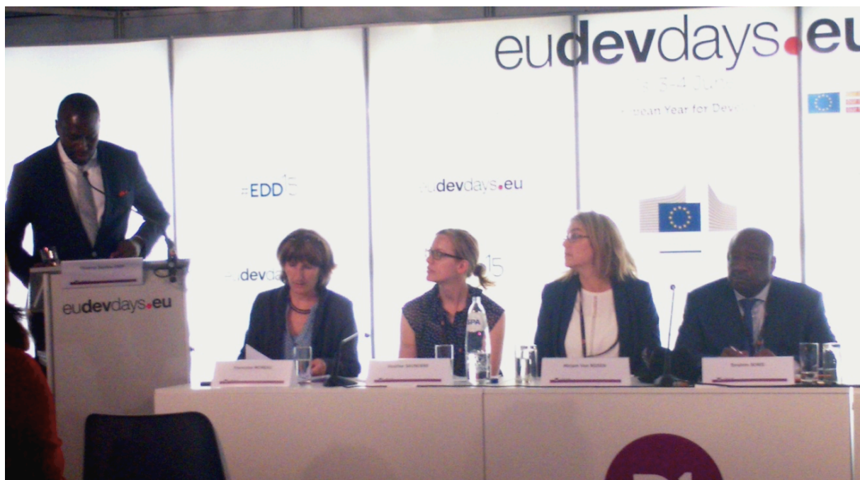
European Development Days in Brussels, 3 June 2015