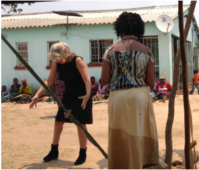
A field visit in Zimbabwe, 2014

In cooperation with Tilburg University, EEPA takes part in a research project on healthcare in African rural areas, particularly on the impact of technical solutions on healthcare in African village healthcare centres. The project involves the research countries, such as Kenya, Uganda, Liberia, Ghana, Zambia, Malawi, Zimbabwe, Germany, UK and the Netherlands. The programme connects the sector of international cooperation with the health sector and engages with relevant private sectors engaged in this area.