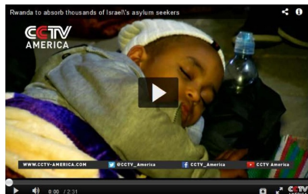
Video. Rwanda to absorb thousands of Israel's asylum seekers. Available at www.cctv-america.com