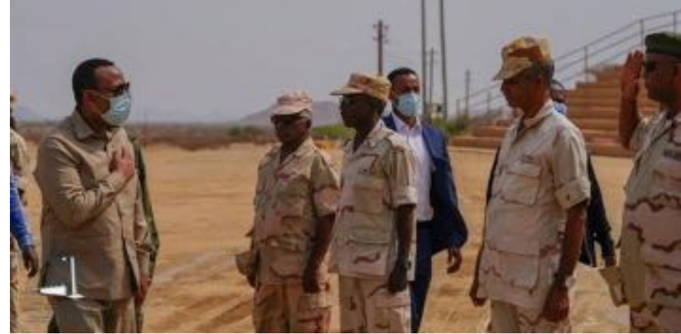
graduation-parade rehearsals of the 33rd Round of the National Service. Prime Minister Dr. Abiy Ahmed and his delegation departed home in the later afternoon hours today after a two-day fruitful working visit